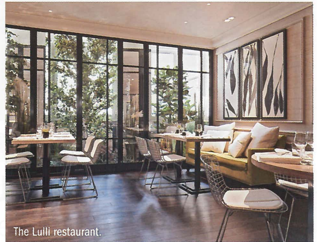
The Lulli restaurant.