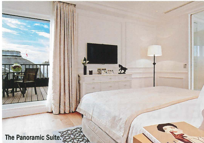
The Panoramic Suite.